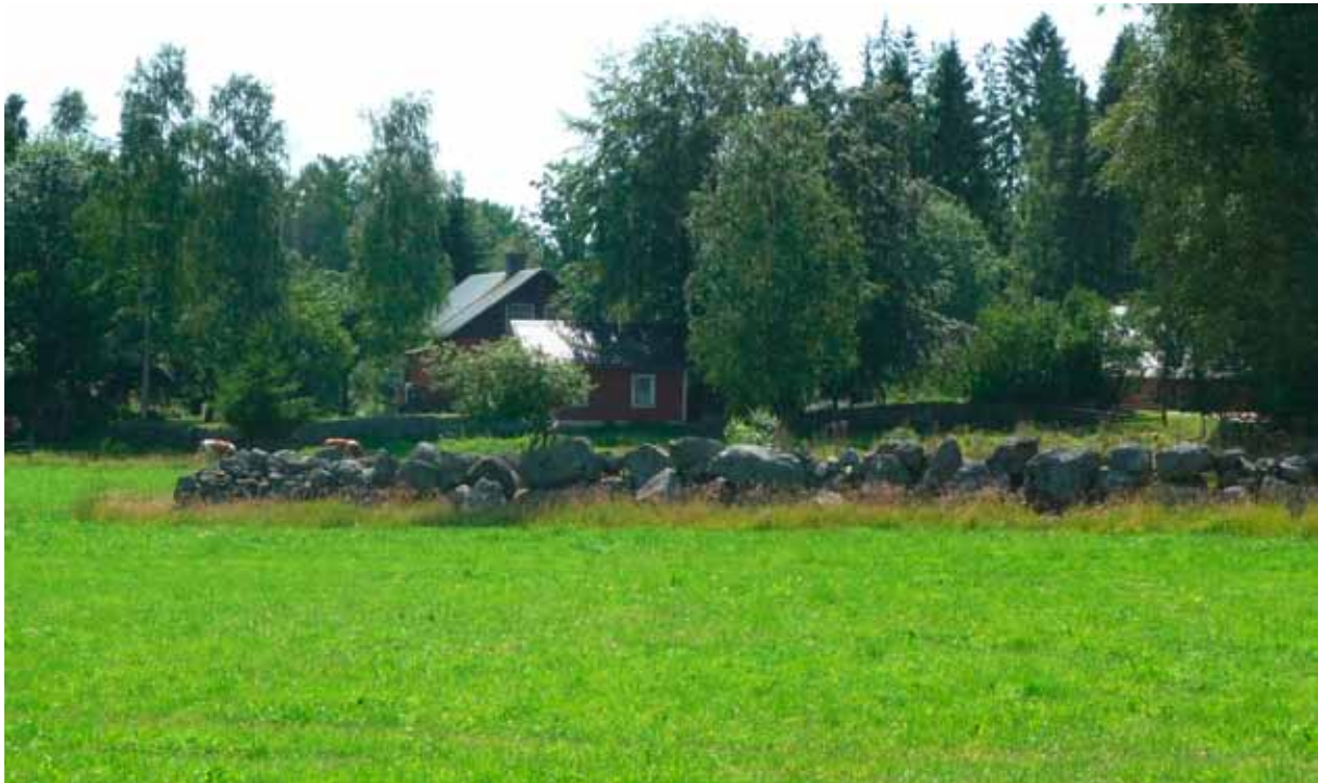
Landscape in Sweden

European Landscape Convention by municipal and regional planning, and establishing a Nordic network of people involved in these issues (Norway, September 2004). The work is presented in the report: Implementering av den europeiske landskapskonvensjonen i lokal og regional planlegging i Norden (55 pages in Norwegian). ANP 2005 : 771.