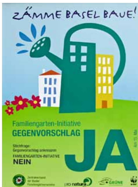
Poster for the protection of the allotment gardens in Basel

In the Town Parliament discussions concerning the construction project „Holligen“ were still going on. During these debates a conservative politician said this allotment garden site produced the most expensive potatoes in the whole of Switzerland!