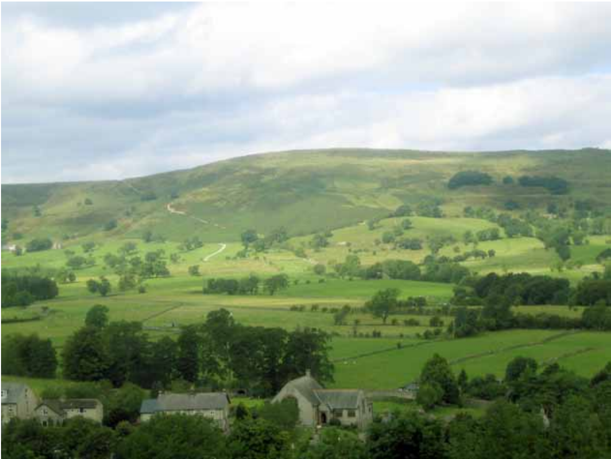
Landscape around Castleton (Great-Britain)