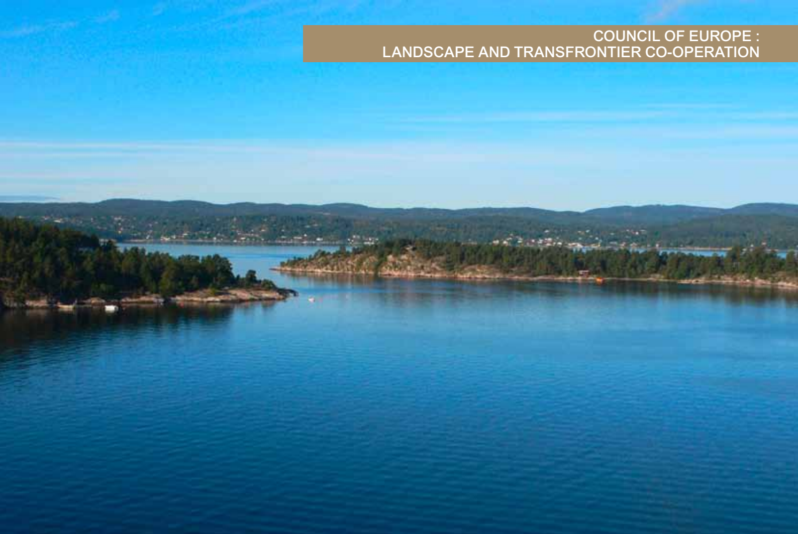
Landscape in Norway