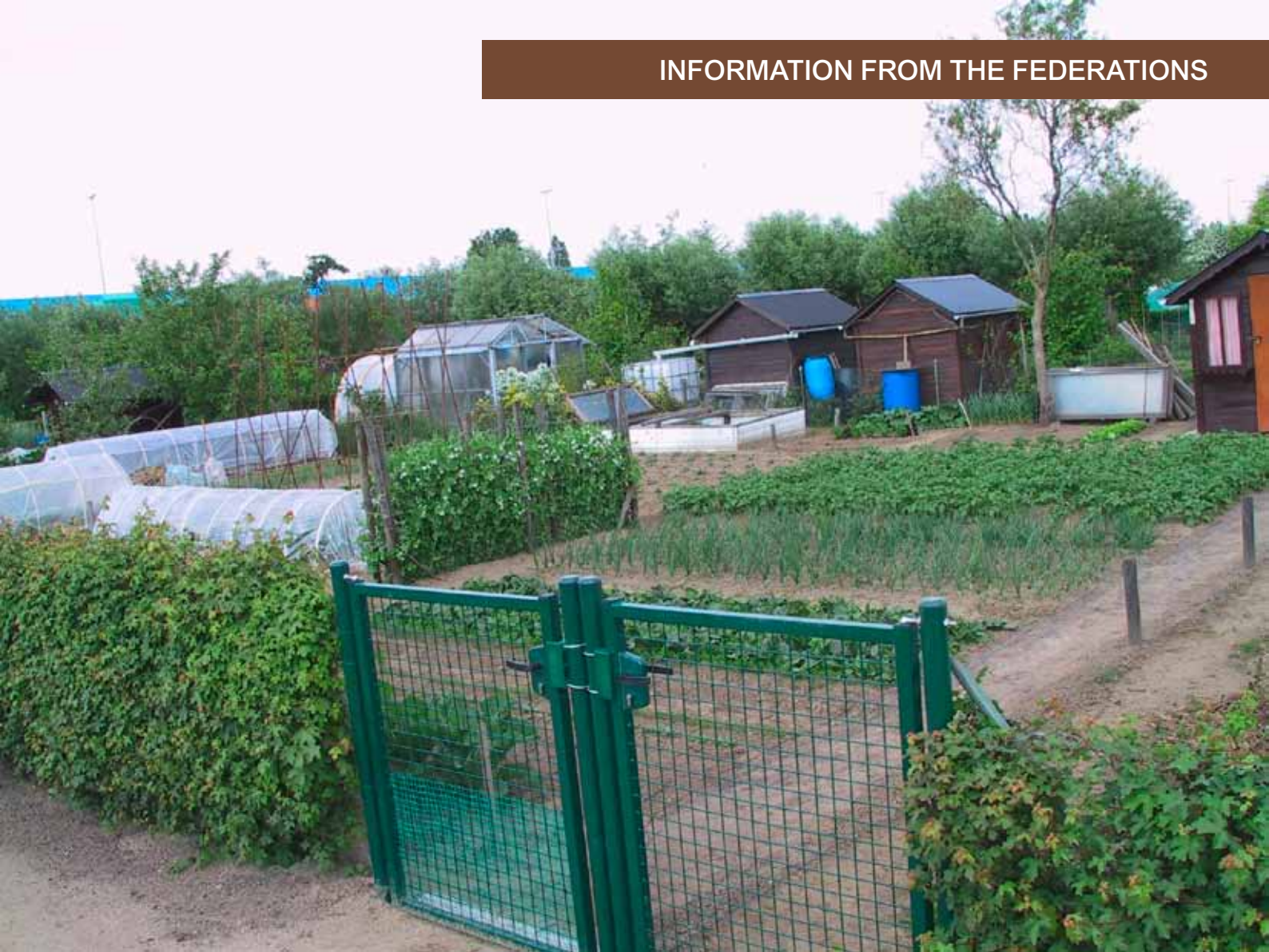
Allotment gardens in Gentbrugge