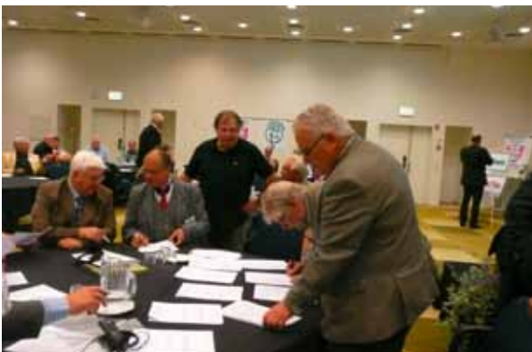
Signing of the resolutions