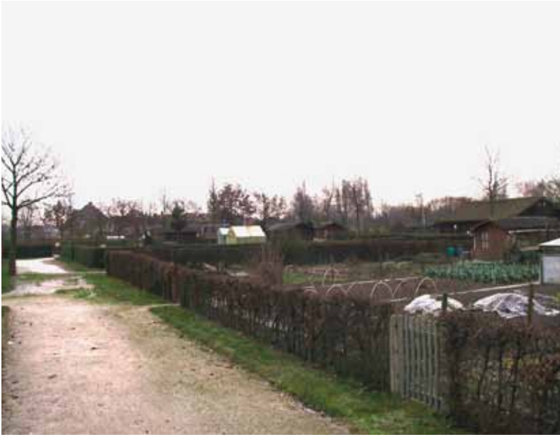
Allotment gardens in St. Amandsberg

ognition for our association as a socio-cultural organisation.