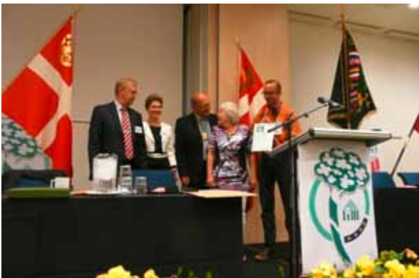
Presentation of the diploma on an ecological gardening to the association „Zonnehoek“ in Amsterdam (NL)