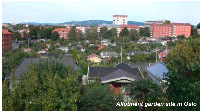
Allotment garden site in Oslo

In general the Norwegian federation lacks the strength of heavy lobbying, but continues to pursue the promotion of allotment gardens as a main ideological and political aim.