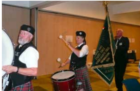
Entrance of the new Office-flag