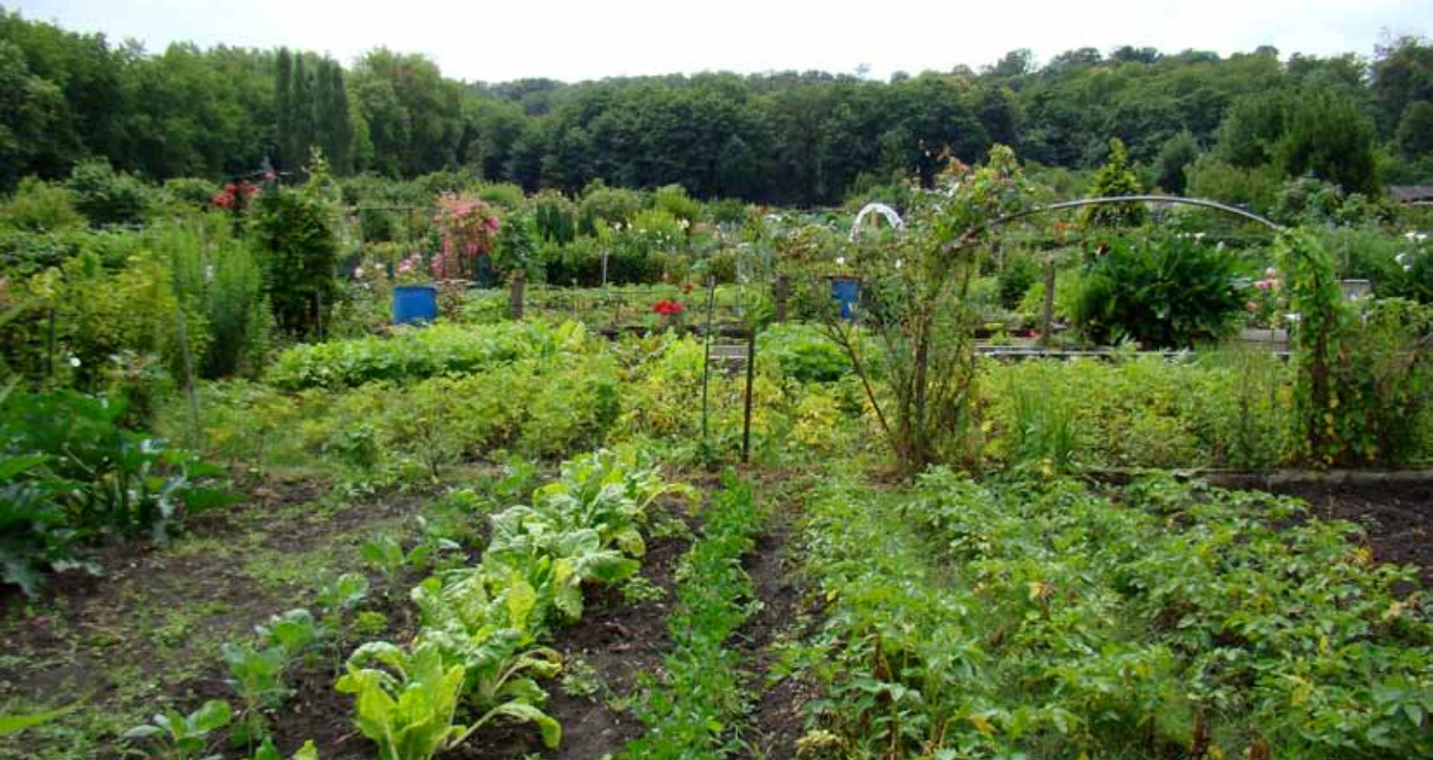
Allotment gardens in Versailles