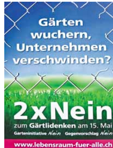
Poster against the protection of the allotment gardens in Basel

The situation is somewhat different in the town of Berne. This town has many areas of green space and even some agricultural land. The acting socialist/green government coalition still wants to build more flats for people. It therefore intends to close down the allotment garden sites and