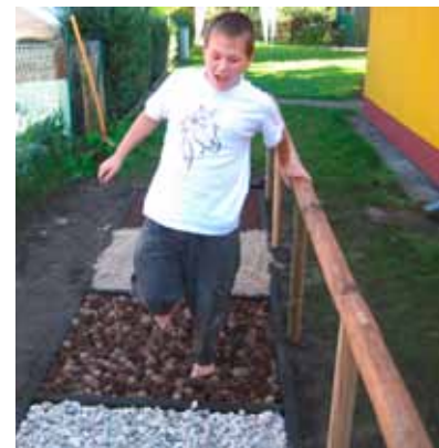
A path to walk barefoot