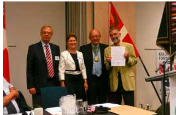
Presentation of the diploma for social activities to the association „Heideland“ in Braunschweig (D)