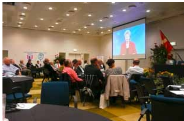
Video-message by Mrs Vivane Reding, Vice-president of the European Commission