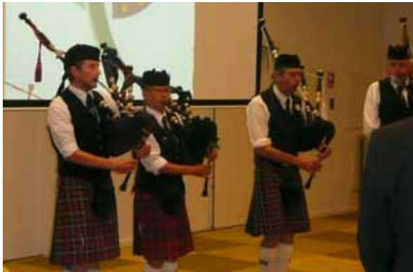
Opening session: Bagpipers