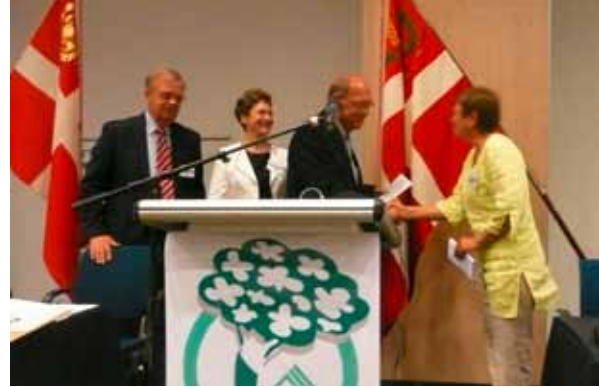
Presentation of the diploma on an ecological gardening to the association „Falan“ in Falun (S)