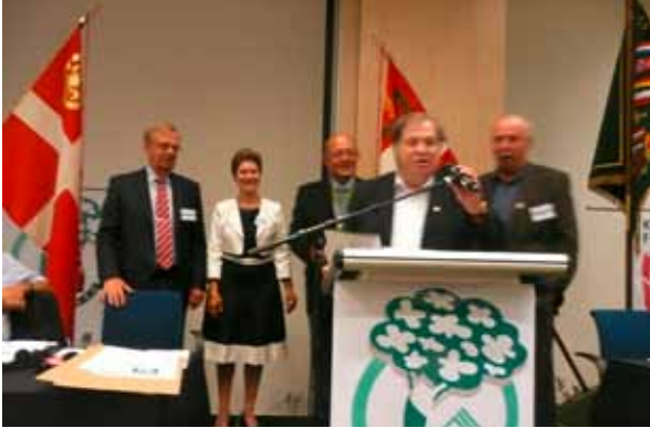
Presentation of the diploma on an ecological gardening to the association „Freiheit“ in Berlin (D)