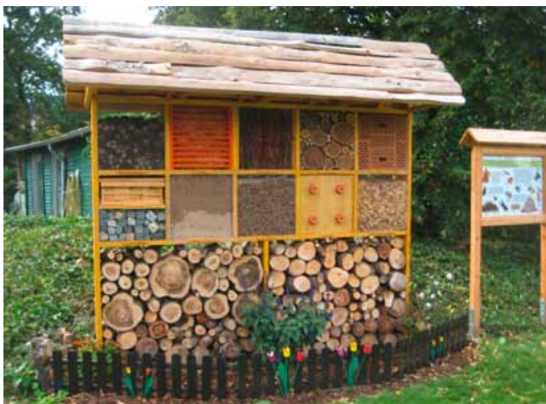
Nest building help for birds

months of work the building phase was finished. The nature trail is a round walk through the whole site and is open free of charge for all visitors during the gardening season. Thirteen stops have been built and have been provided with exhibition boards. They give in various forms information about nature. You can find an insect hotel here, an ornamental and educational garden used as a green class room, a fruit bush for birds and insects, a street for tasting fruit, a heap of branches and a dry wall to allow hedgehogs to live here. There is also a board with models explaining different ways of how to help birds nesting, a herb garden, a dendrophon as well as a model beehive and a quiz station.