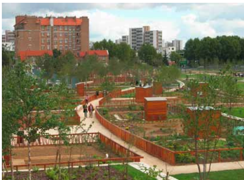
Allotment gardens in Maison Alfort

The member associations organise many social projects. We can mention for example gardens aiming at the re-assimilation of young offenders into society, gardens for handicapped and elderly people, school gardens and learning gardens as well as places to educate and to meet for both allotment gardeners and hobby gardeners who are not member of the federation.