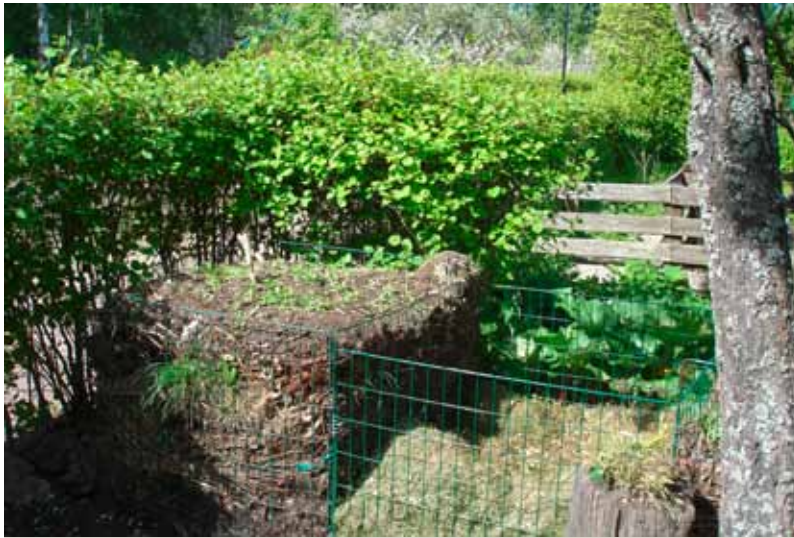
Compost on a plot

of events for Marjaniemi allotment gardeners where it is possible for them by listening, discussing and asking questions to learn about ecological alternatives, procedures and operation models. Ecological gardening is a wide subject including for example responsible choice of building and other materials, ecological cultivation of crops, use of environmentally friendly methods of bug killing, composting at one's own plot, waste handling as regulated by the community and respect for community values. The Committee has published a guide called "Environmental Guide for Allotment Gardeners in Marjaniemi". There are practical advice and hints about ecological leisure and cultivation in the Guide.