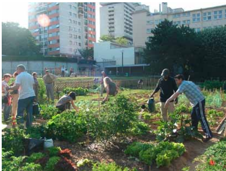
Allotment gardens in Bédier Boutroux

The allotment gardens can be equipped with a tool shed, with a maximum size of 4 sq metres. It is forbidden to use them as a perma-