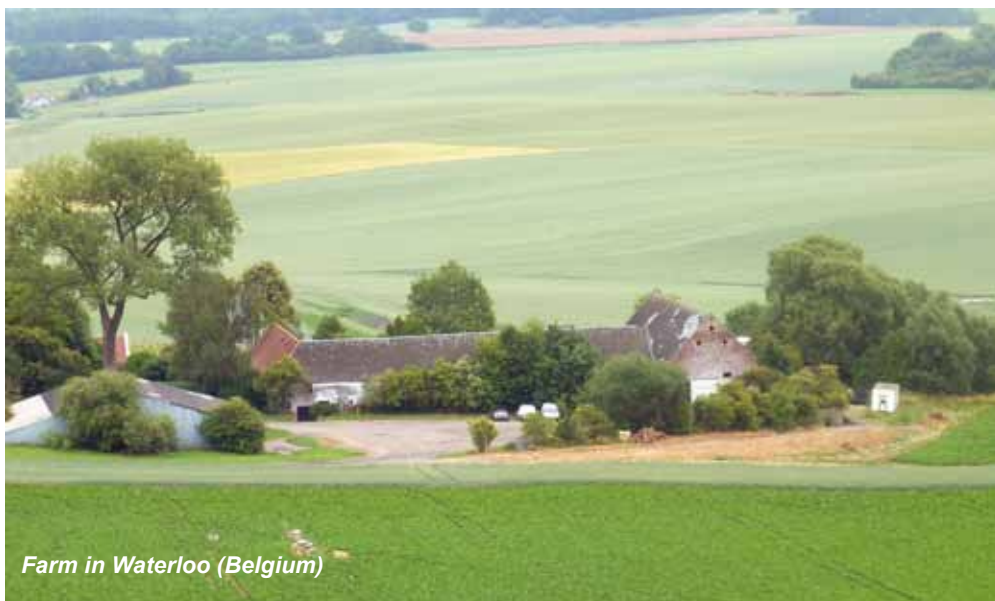
Farm in Waterloo (Belgium)

responses to landscape in twelve places in eight countries, using the metaphor of stories to frame different perceptions of landscape.