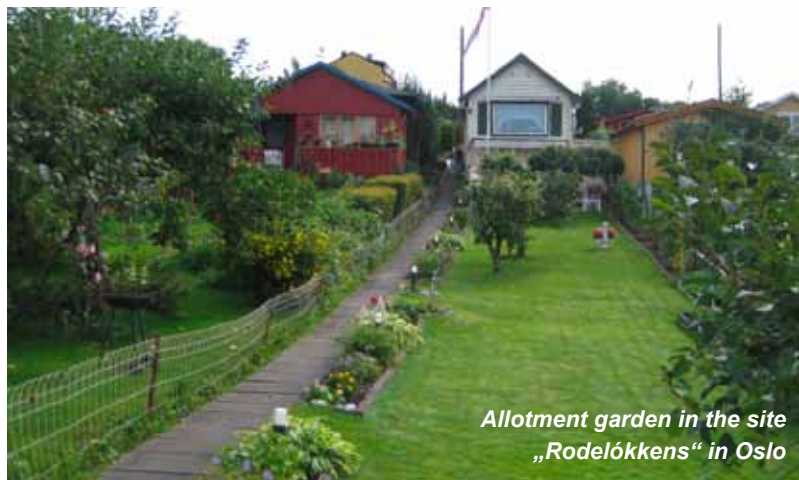
Allotment garden in the site „Rodeløkkens“ in Oslo