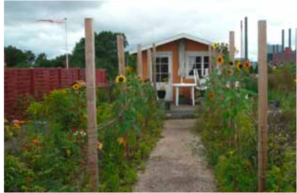
Allotment gardens in Copenhagen